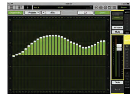
OUTPUT GEQ + RTA