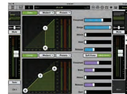
GATE / COMP